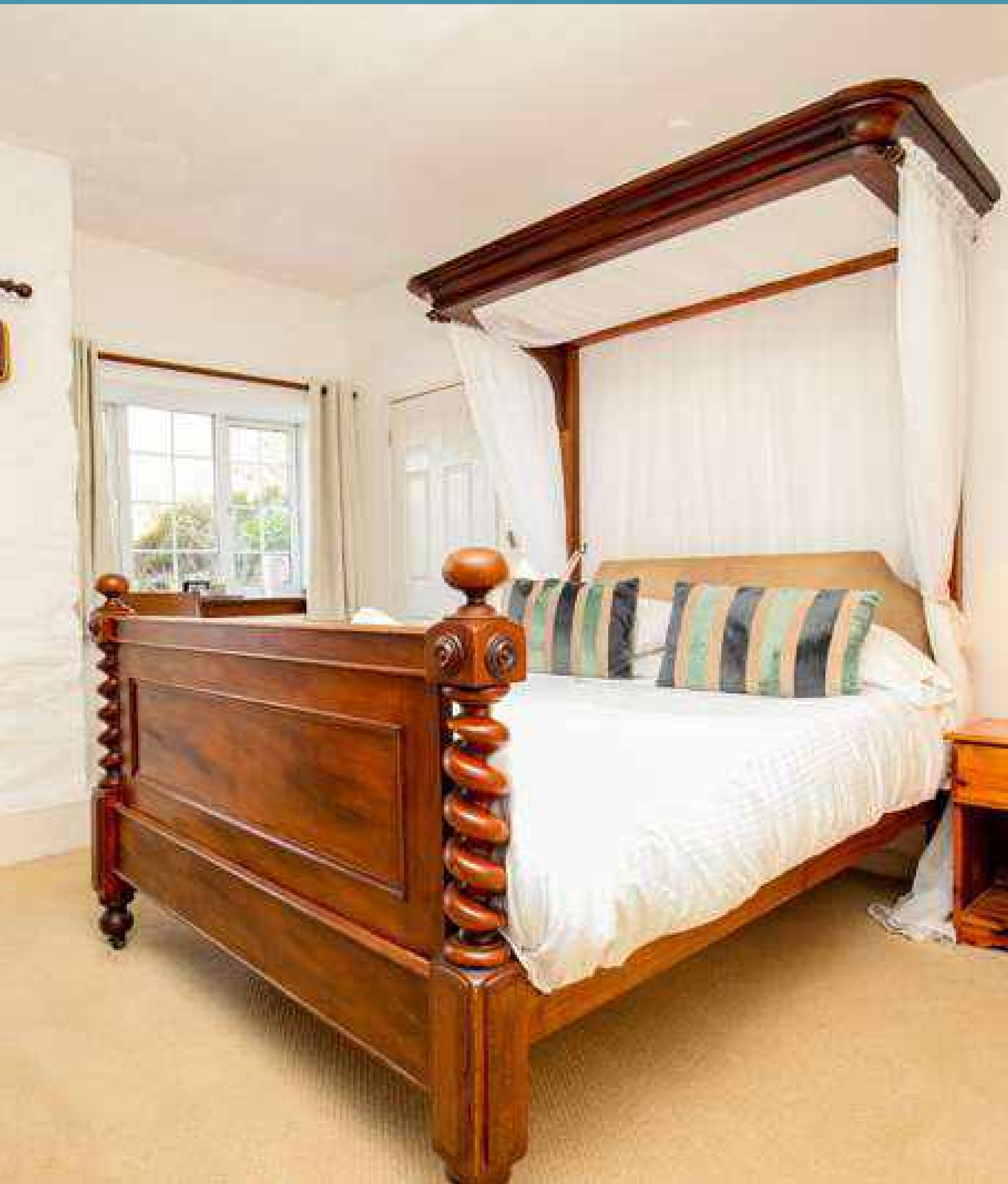
Room 2, King size, sea view room